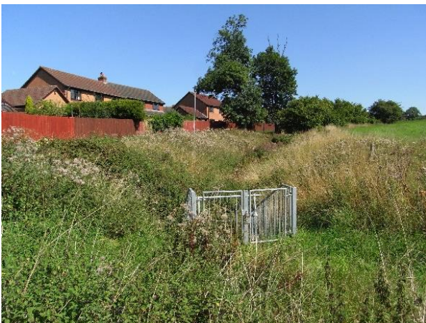
A small stream – Boundary Brook - separates the estate from the farmland. It flows southwards along the edge

of Upper Wood and skirts the eastern edge of the estate. A small pool has been excavated where the Brook is culverted under the footpath by the Wicket Gate . The lower course of Boundary Brook is lined with caissons containing boulders; presumably to reduce the water flow. It then flows through a culvert and under Saddler Avenue .