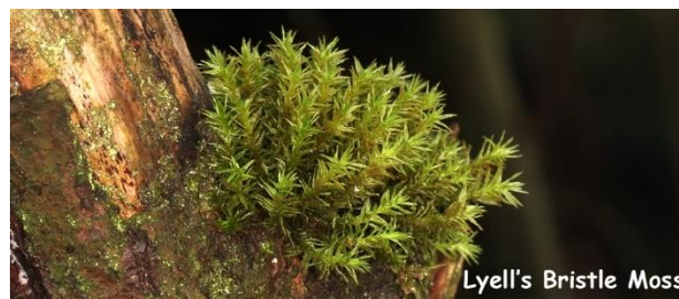
Lyell's Bristle Moss