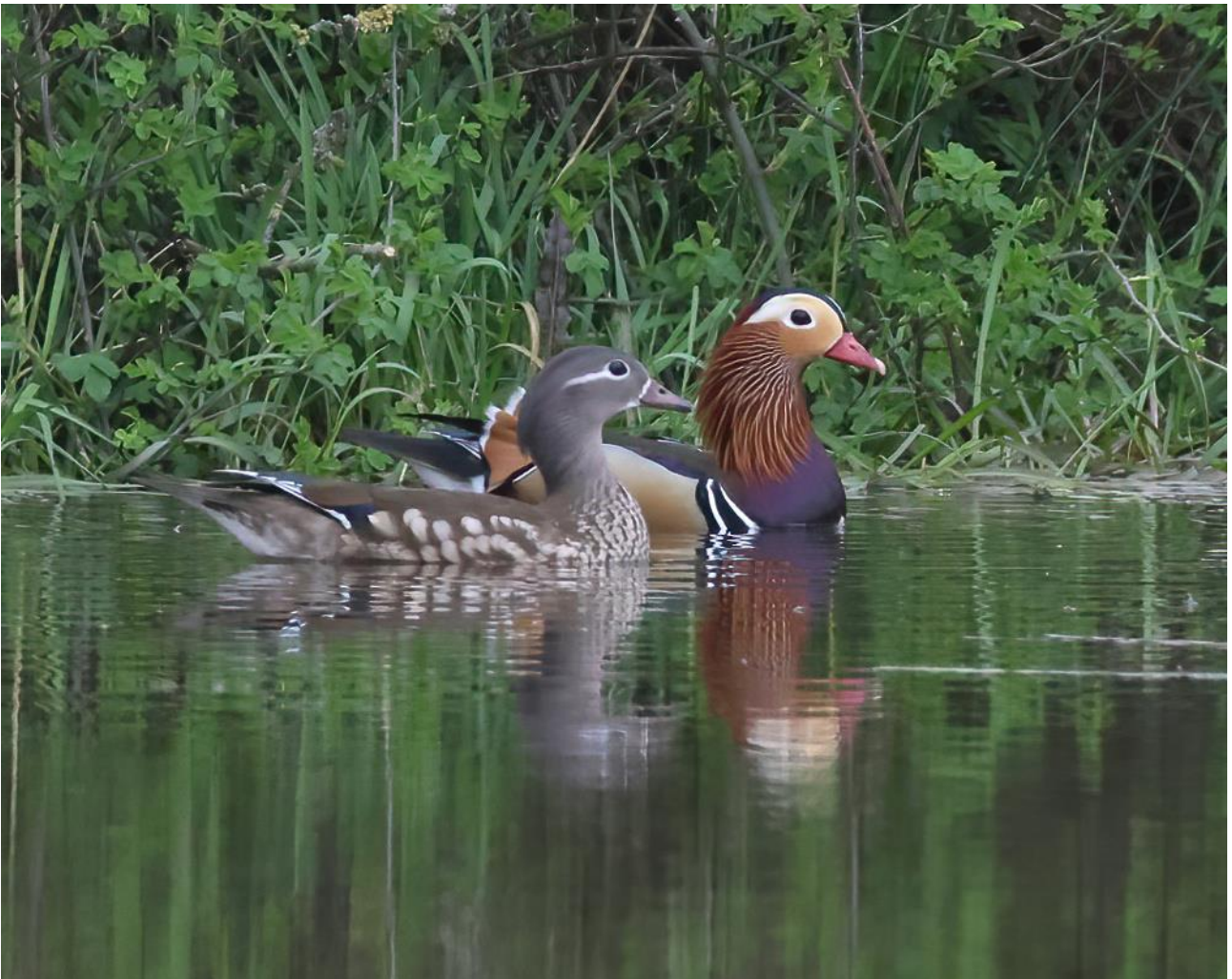
Mandarins on The Pond